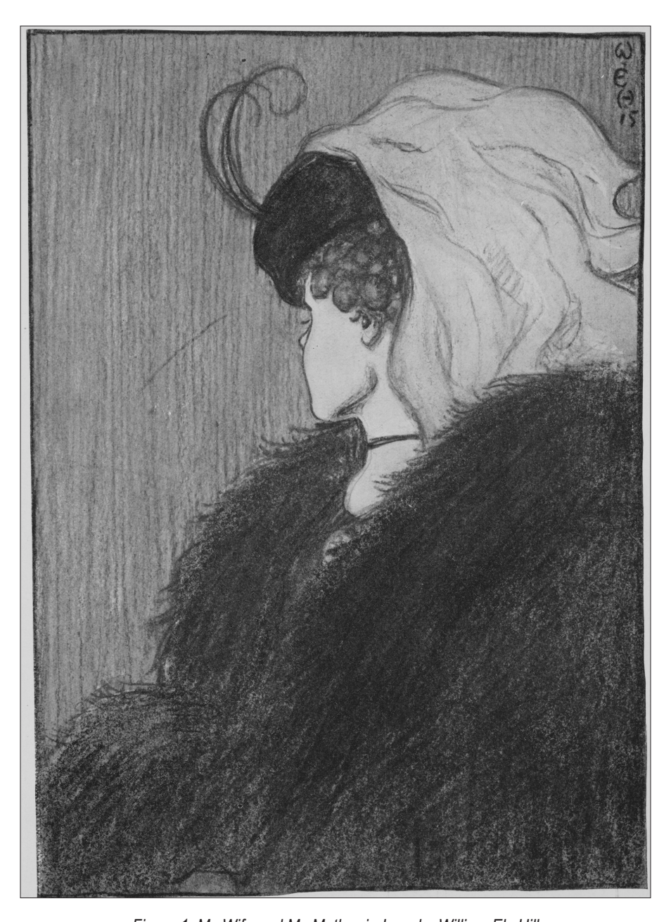
Figure 1. My Wife and My Mother-in-Law, by William Ely Hill