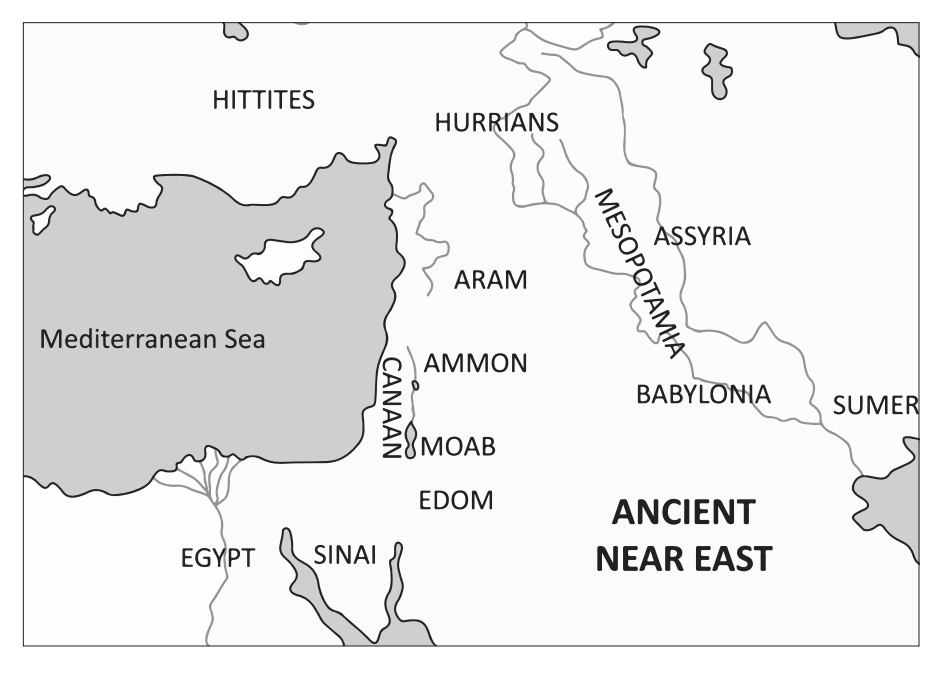
Figure 2. Map of the ancient Near East (Not all identi ied people groups or nations were present at the same time.)